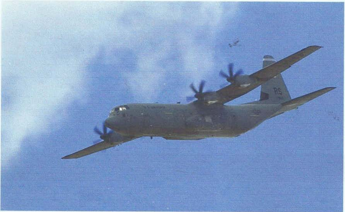
C-130J Super Hercules

C-130Js are meant for rapidly rushing troops and equipment to "advanced landing grounds" in eastern Ladakh and Arunachal Pradesh to strengthen deterrence military capabilities against China.