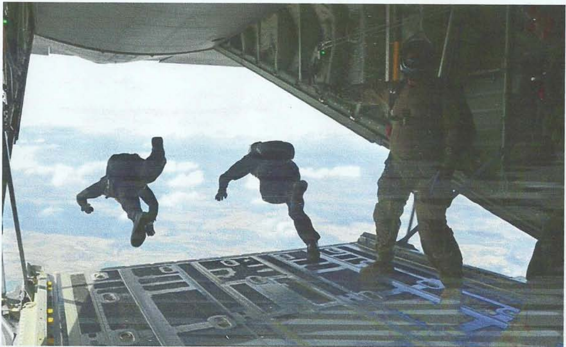
C-130J Super Hercules

C-130Js are meant for rapidly rushing troops and equipment to "advanced landing grounds" in eastern Ladakh and Arunachal Pradesh to strengthen deterrence military capabilities against China.