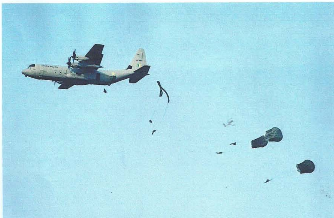
C-130J Super Hercules.jpg

It is based at Panagarh in West Bengal to take care of the eastern sector with China. The Army's new mountain strike corps will also have its headquarters in Panagarh.