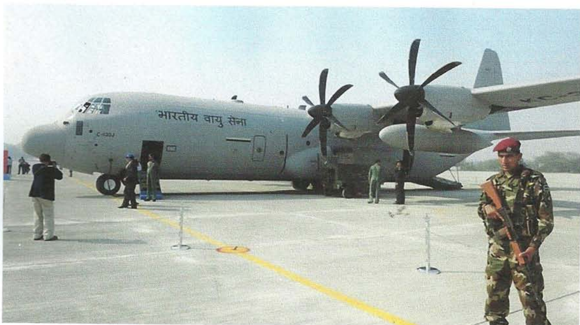
C-130J Super Hercules

The Hercules family has the longest continuous production run of any military aircraft in history.