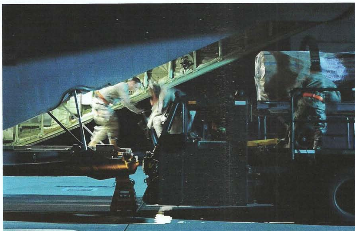
C-130J Super Hercules

It is based at Panagarh in West Bengal to take care of the eastern sector with China. The Army's new mountain strike corps will also have its headquarters in Panagarh.